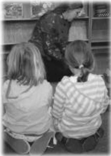
Good Friends, Good Stories