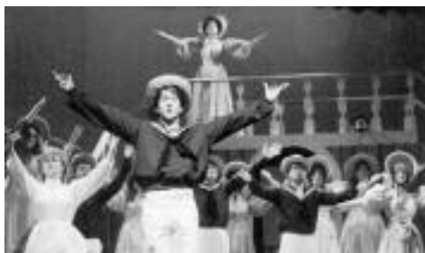
The Ohio Light Opera invites you to "Sail the Ocean Blue" at The Wooster Book Company

Please bring your hobby, craft, or interest to us and let us show you how we can sustain the fun and enthusiasm of your organization.