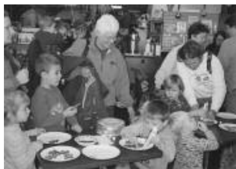
Crafts and hobbies of all interests and for all ages—we're interested in your interests

We are open in the evenings from Memorial Day to Christmas, have a great easy-to-find location (our sign is sixty feet long—yes I know, but it's tasteful), and this really is an open-arms invitation. It is an honor and a privilege for us to host events, and books complement every kind of program. We are genuinely interested in nearly everything (job applicants