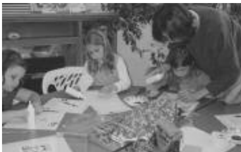
We're always doin' somethin' at The Wooster Book Company